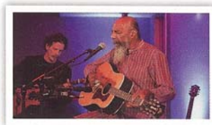
Richie Havens performing.