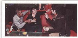
Guests socializing in the Circle Furniture lounge.